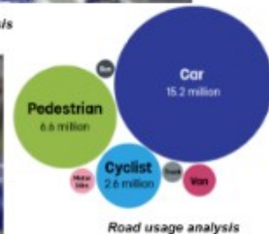
Road usage analysis

Commercial in Confidence | ©2024 VivaCity Labs Ltd | All Rights Reserved