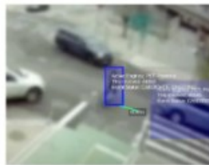
Near miss analysis

Key Insight - Cyclist right of way at Smith Street intersection was causing a high frequency of unsafe events