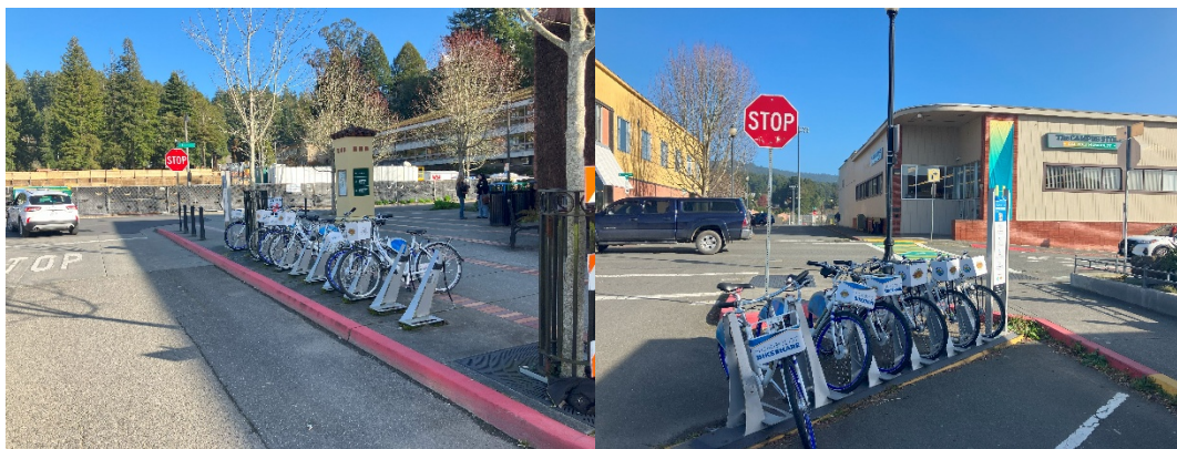
Figure 2: Bike share stations at Cal Poly Humboldt (left) and 8th & G St (right)

With the increases in total rentals, there has been a proportionate 8% increase in revenue generation from the project between 2022 and 2023. The City is requesting funds to continue the implementation of forty turnkey bicycles at our six stations. The annual cost of implementing a bicycle at the existing bike share locations is $1,800.00 per bicycle. The total cost of implementing forty bicycles is approximately $72,000.00 per year.