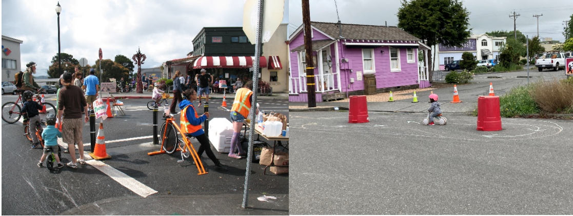
Figure 3: Bike Rodeo , Arcata (Arcata Plaza 2006 and Creamery District 2023)

Each criterion questions for this project are addressed below.