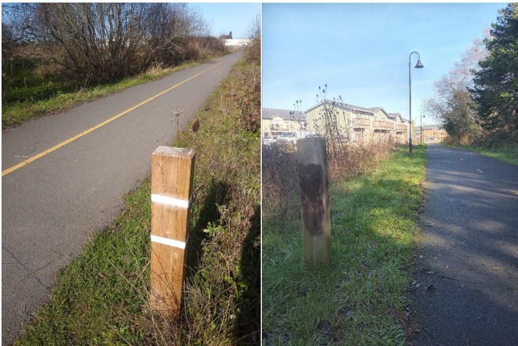
Figure 1: Eco-Counters at Humboldt Bay Trail near Samoa Blvd (left) and at Shay Park (right)

The City of Arcata currently uses the Eco-Visio Professional Subscription for the City's pedestrian/bicycle counters. The annual subscription allows the City to access the Eco-Visio online data analysis platform, gain technical support, monitor equipment, and analyze trends (see Attachment 2). Annual subscription renewal amounts to $540.00 per counter per year. With the City's three counters, the annual subscription cost is $ 1,620.00 per year.