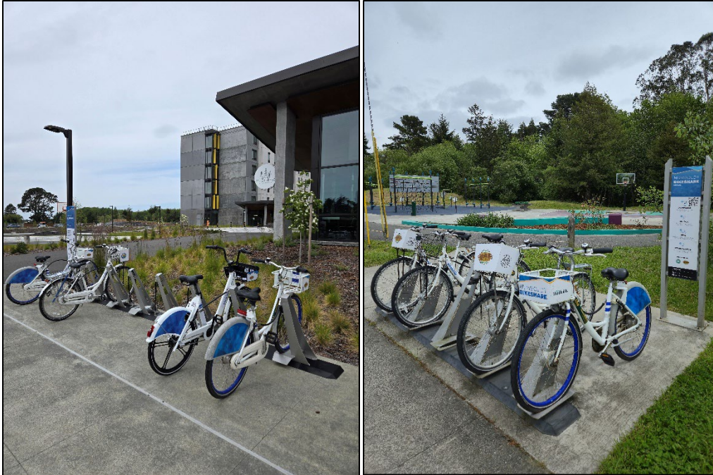
Figure 2: Bike share stations at Cal Poly Humboldt Dorms (left) and Shay Park (right)

Each criterion questions for this project are addressed below.